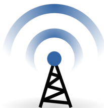
FCC Announces Broadband Funding