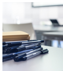
OSHA Certification Opportunity