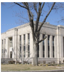
County Spotlight: Obion County

To read the full press release, click here: http://www.ctas.tennessee.edu/sites/default/files/pr18-10.pdf .